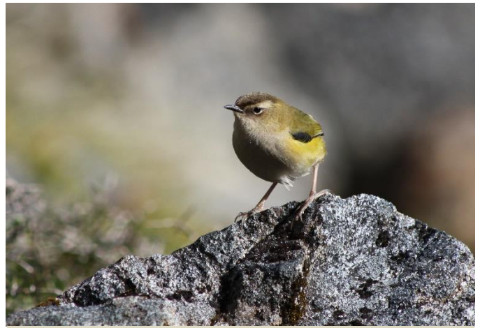
Rock wren/tuke.