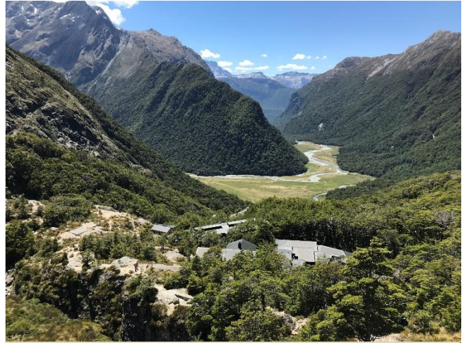
The Routeburn Valley.

On-going ground operations including hand-laid baiting, bait stations, and trapping programmes support this work. We will monitor rats after the operation to quantify its success. We will continue to monitor mohua each summer to see the population trends over time.